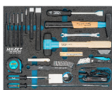
163-372/25 • ●